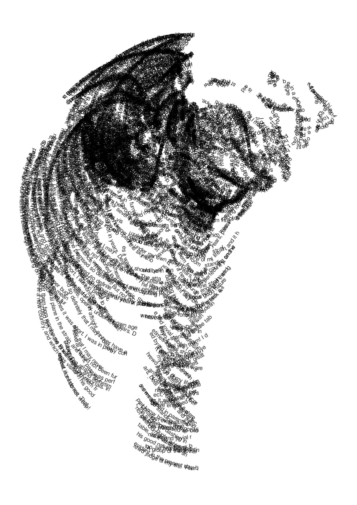
the sky should be in a new country (top | bottom | right)